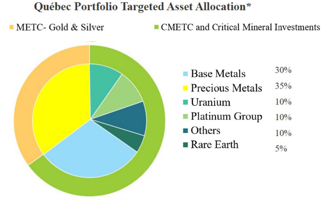
*Subject to availability and market conditions at time of investment

It is anticipated that the Portfolios will include a significant number of junior Resource Companies. Each Portfolio will invest its Available Funds in Flow-Through Shares of Resource Companies which are listed on a stock exchange and at least 15% (in the case of the National Class) and 10% (in the case of the Québec Class) of the Available Funds in Flow-Through Shares of Resource Companies which are listed and posted for trading on the TSX or the TSXV. The Portfolio Manager intends, whenever possible, to negotiate for the inclusion of incentives such as Warrants along with the Flow-Through Shares to be purchased by the Partnership.